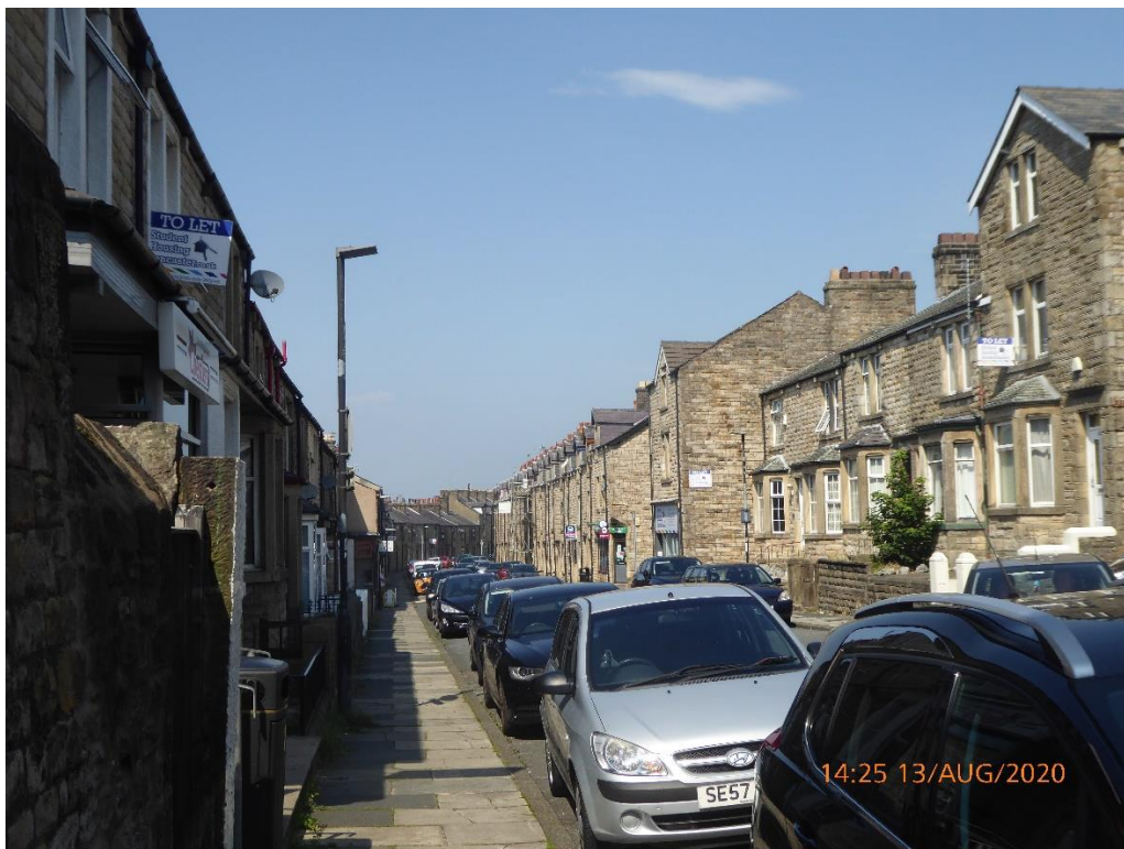
Prospect Road – 8 signs displayed during the summer period