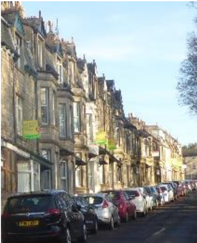
St. Oswald Street