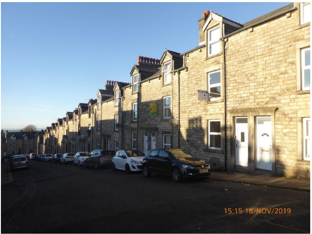
Clarence Street (check)