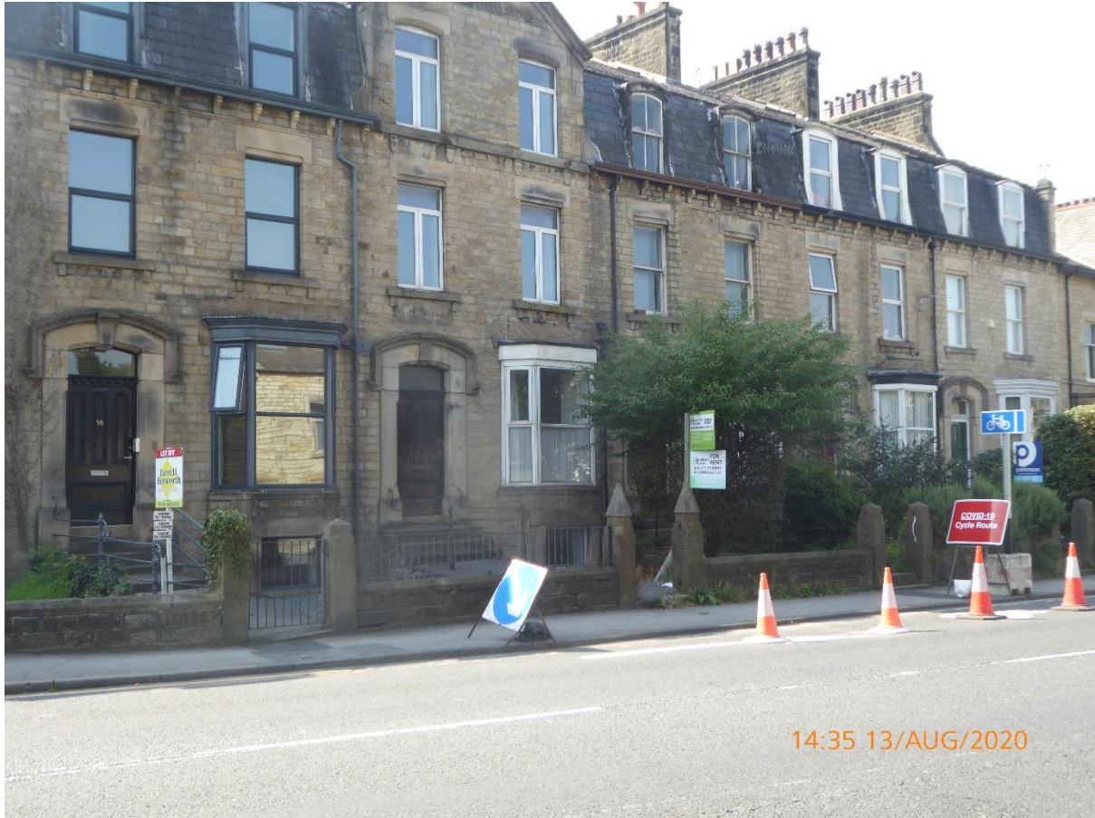
South Road – 4 signs along a short stretch displayed during the summer period